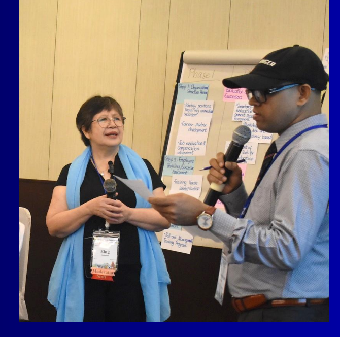
CU Executive Society